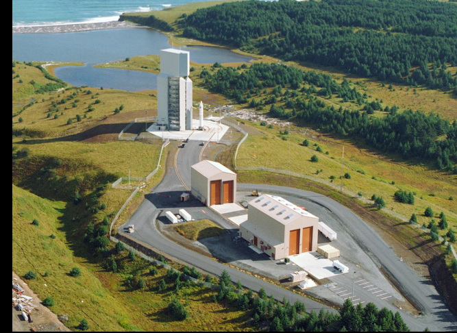
Photos: [top] Pacific Spaceport Complex (Kodiak, AK), [below] Clear Space Force Base (Clear, AK)

In the near future, we will see the first launchings of commercial space stations, further explorations of the lunar surface, missions to Mars, and the use of new space technology developed by people on Earth.