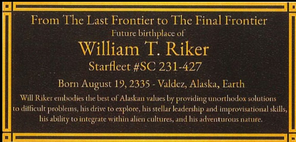
Proposed bronze plaque for the bench and statue