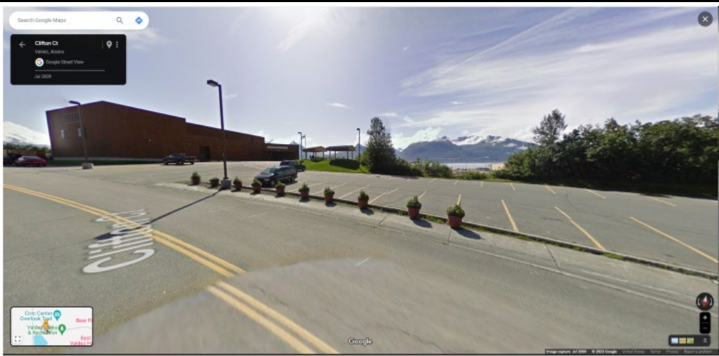
Photo of the Valdez Civic Center.

The Riker Maneuver believes that the best spot for such a unique statue would be at the Valdez Civic Center/Ruth Pond Park. This area can accommodate foot and vehicle traffic, statue stewardship could easily be covered by the city during their routine property maintenance, and it is easy to find. In the following photos, you can see that there is plenty of green space that could be considered without taking away from the scenic view.