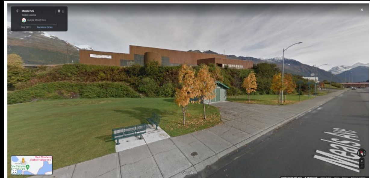
Photo of the Civic Center from Meals Ave.