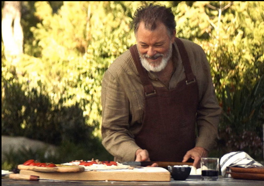
Will Riker making pizza in Picard season 1.