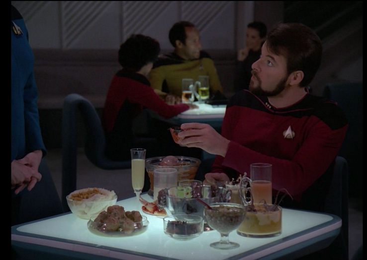
Commander Riker loads up on Klingon food in preparation for his posting on a Klingon battlecruiser, in Star Trek: The Next Generation , "A Matter of Honor".

There are a handful of other cities that have embraced their ties to various Star Trek characters. It has increased tourism and has provided a novelty that some local businesses opt to tribute. In the case with Commander Riker, this could be reflected in his love of cooking (seen throughout The Next Generation , Enterprise s04e22, and making pizza in Picard season 1), his red shirt could lead to a Commander Riker's Red Ale at a local brewery, and there is his time in Valdez where he often went fishing.