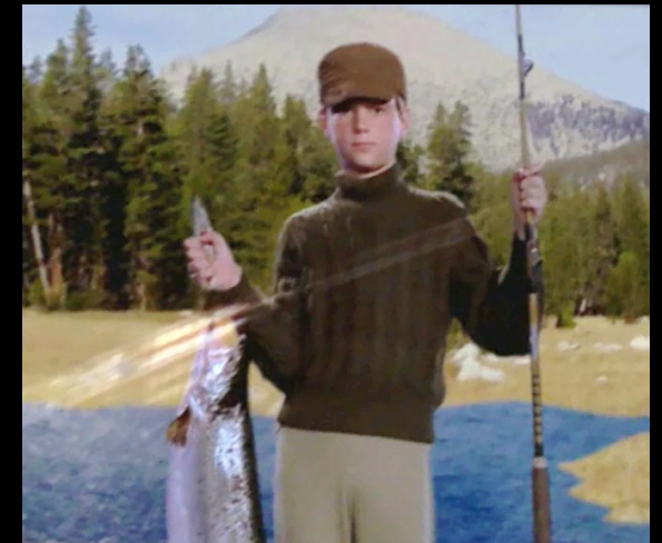
William Riker holding a rod and caught salmon from Star Trek: The Next Generation , "The Icarus Factor".