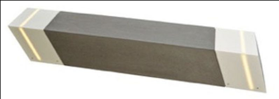
Bench design from Park Warehouse